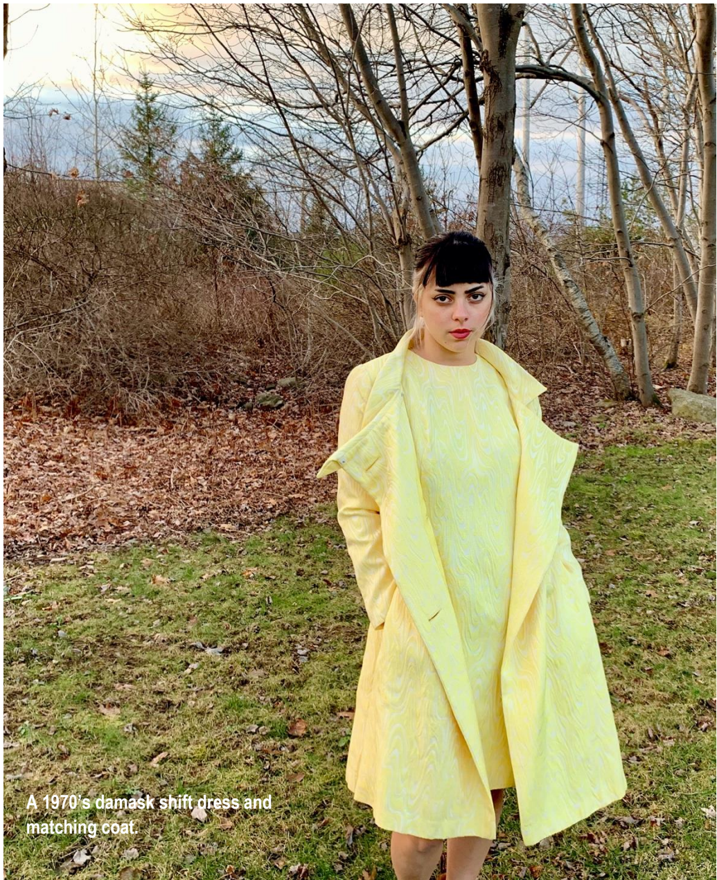
A 1970's damask shift dress and matching coat.