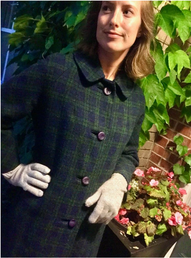
Vintage blue and green plaid coat

those people who really enjoy wearing vintage clothing in the style they are meant to be worn and will wear a complete outfit in a 1920s or a 1960s fashion era. As awesome as that looks, you don't need to do that. You can do what I like to do and bring the vintage piece into the modern era. To get the most out of vintage style clothing, it's a help if you know