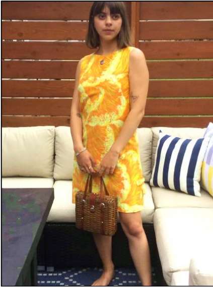
Wearing a 1960's yellow and orange patterned shift dress and 1960's wicker purse.

• Dare to wear two or more vintage items with modern pieces. For example, I sell the vintage matching dress and coat iconic of the 1960s. Some of these pieces are a complete outfit. However, if you want to look