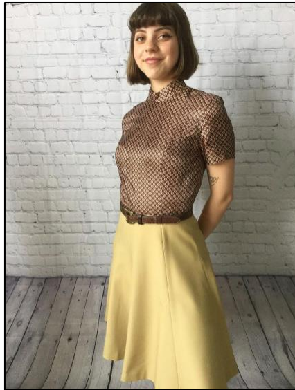
A 1950's 'Ivan Frederics' dress.

The world of vintage fashion means wearing items of clothing that have a history and offer a window to the past while also creating a unique fashion statement. Wearing vintage clothing does not mean being outdated ... quite the opposite. In fact, vintage clothing is the in-style thing to wear.