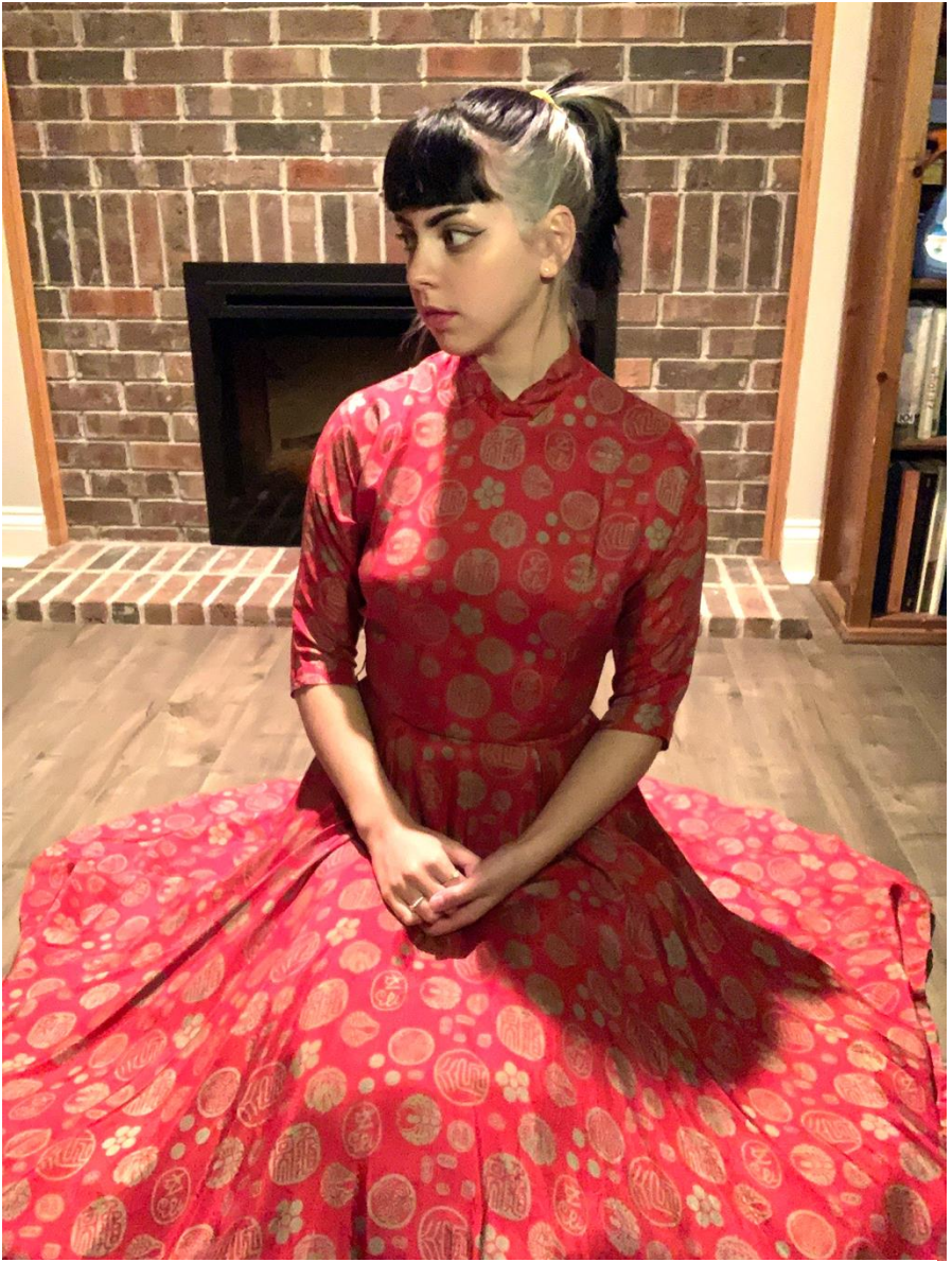
A 1950's red silk dress.