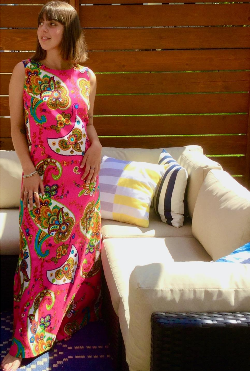
A 1960's fuchsia paisley and flower maxi dress.